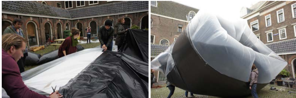
Figure 4 Form-Study Workshop Exercise, Sub-Problems: Donut inspired shape by inflatable foil construction.

To be able to accommodate a wide material and form intuition, a broad scope of materials and techniques is covered in exercises. Starting with small-scale studies, in wood, plaster, cardboard etc., the student finishes with world-scale architecture prototypes.