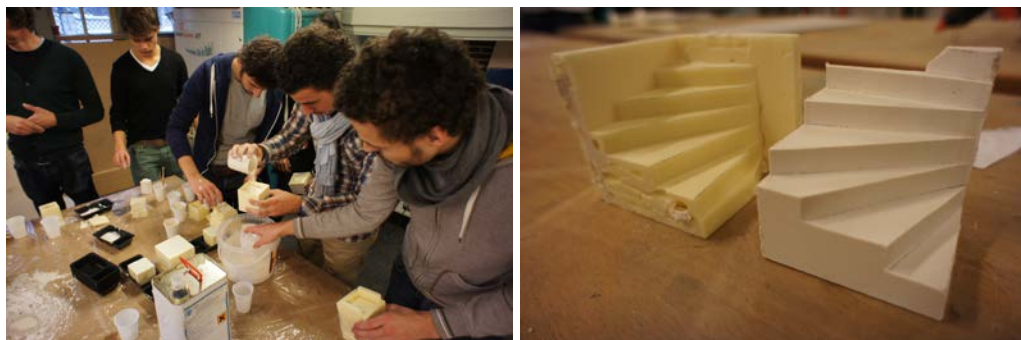
Figure 3 Form-Study Workshop Exercise, Sub-Problems: Pyramid inspired shape by using foam formwork and plaster.

In this study, the aim is to expand the student's explicit knowledge application to a more implicit, intuitive knowledge production. By starting with a set of, often uncomfortable, sub-problems (1), the student is motivated to acquire knowledge by doing. By a trial-and-error method, the student learns by assimilation and accommodation . By assimilation, new knowledge is incorporated into the existing knowledge, by accommodation conflicting knowledge is reworked into a more sufficient alternative and incorporated into the design (3) (Salama, 2007).