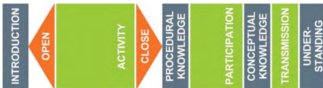
FIGURE 11: Learning Situation for Understanding

Because no significant learning improvement was measured in the comparison of both learning situations, students' expressed preference is used for further development. In order to accommodate student requests for personal feedback and discussion, the inductive learning situation is extended by a transmission interaction (Figure 11). In this part students are supported in the transformation of procedural knowledge into conceptual knowledge by using domain specific vocabulary. When students become aware of the conceptual knowledge, discussed in the construction exercise, and when they are able to frame this knowledge into the domain specific vocabulary, we can speak of understanding.