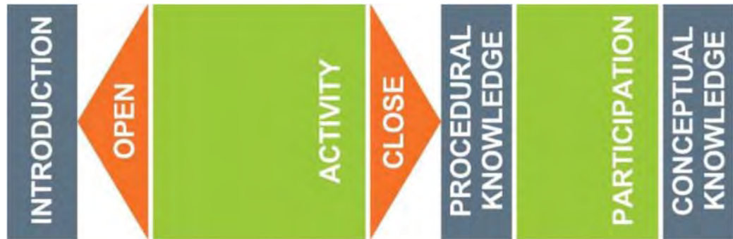
FIGURE 3: Inductive Learning Situation

In a preliminary study by the first author, the original model of the game world was used in a workshop exercise at HKU Utrecht School of the Arts. In this exercise, students are asked to design a chair with a specific set of materials and products, and to provide construction drawings for it to be built. Then students are asked to exchange their construction drawings with another group of students, and to build the chair according to the drawings of the other group.