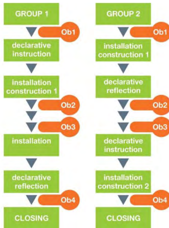
FIGURE 7: Cross-lagged panel model for workshop data collection with four observation points

Different students have different ways of learning. For instance, some students prefer being active and doing things, while others like to sit still, watch and think. In order to obtain two comparable groups with respect to these learning preferences, Kolb's Learning Style Inventory (LSI) Version 3.1 was used (Kolb and Kolb, 2005). In this inventory, students are asked a series of questions that discuss their specific learning characteristics. The outcome of the inventory is measured on two axis. The way we process information is situated on the horizontal axis: the learning modes active experimentation (AE) and reflective observation (RO) are situated here at both ends. The way we perceive information is situated on the vertical axis: concrete experience (CE) is placed on the one side of the scope and abstract conceptualisation (AC) on the other (Richmond and Cummings, 2005; Demirbas and Demirkan, 2007). The combination of the highest score of each scale results in a converging (AC/AE), diverging (CE/RO), accommodating (CE/AE) or assimilating (AC/RO) learning preference.