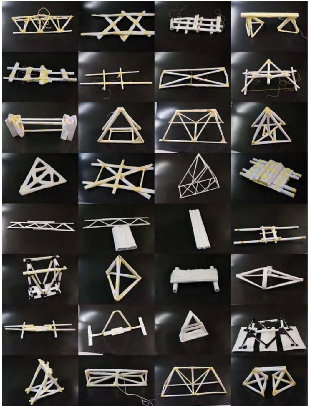
FIGURE 9: Construction models from exercise 2