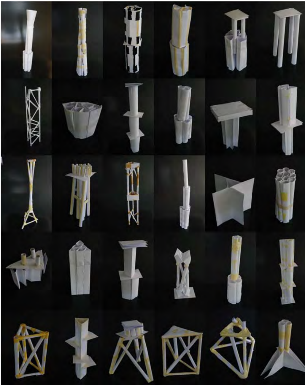
FIGURE 8: Construction models from exercise 1