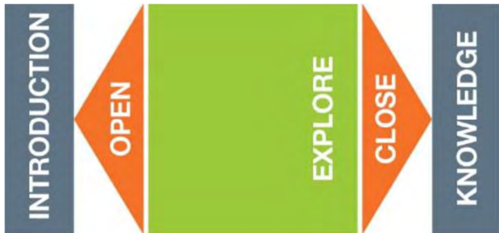
FIGURE 1: Original Learning Situation of the Game World

practicum as a structured game or a series of puzzles, the student may enter familiar ground and engage more easily.