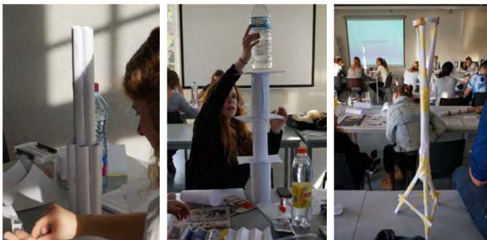
FIGURE 5: First building exercise

The learning situation as discussed in the previous section are investigated in a workshop as part of a structural-design course at KU Leuven, Faculty of Architecture in Belgium. The group of second bachelor interior architecture students participating in the workshop consists of 61 students in total: 13 male students and 48 female students. The workshop involves two building exercises, covering multiple aspects of structural mechanics and structural analysis.