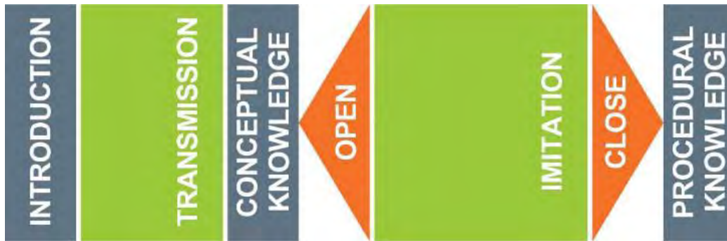
FIGURE 4: Deductive Learning Situation

with the teacher, discussing the construction model with an emphasis on conceptual understanding. By doing so, they become consciously aware of the conceptual knowledge as studied in the act of making.